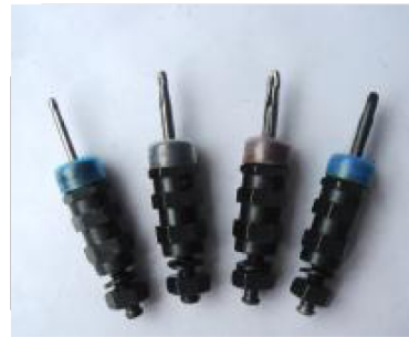
< METRIC >