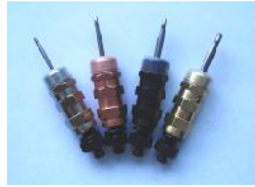
< FRACTIONAL >

Used for clamping two or more pieces of structure at desired clamp load forces utilizing industry standard "cleco" type pneumatic tooling